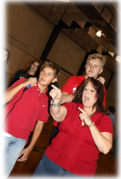
Below: Some of our awesome parent volunteers!