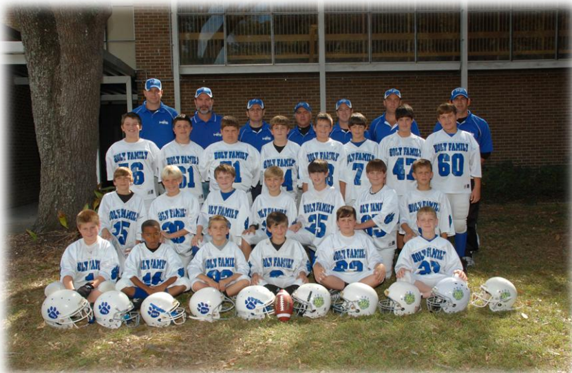
Left: Our 5 th & 6 th grade football team and coaches